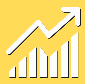
Business/organization development: Revenue planning, opportunity exploration, business and governance modeling, value proposition.