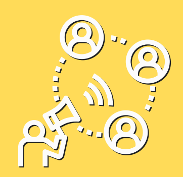
Communications: Content and communications strategy, digital organizing and grassroots storytelling, cultural organizing.